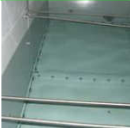
Tank Inspections & Disinfection