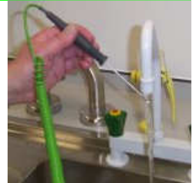
Water Temperature Monitoring